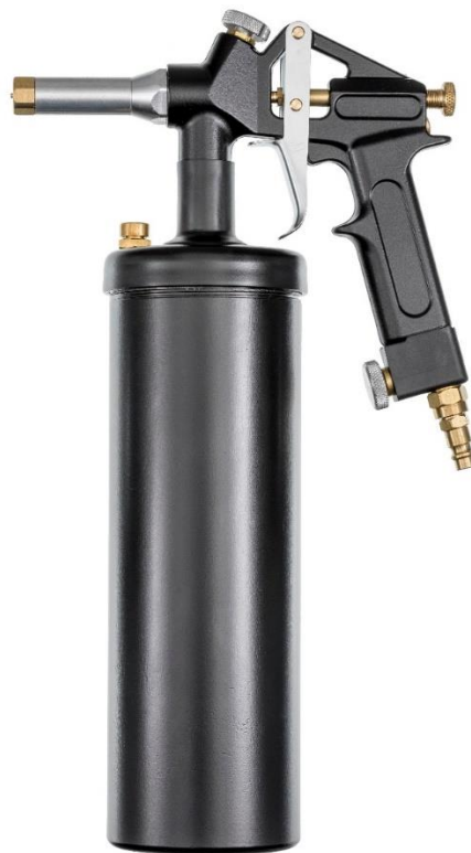
Illustration shows 3000 FGR